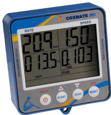
Coxmate HC for coxless boats;

We also sell the micro-impellers separately, and they work with NK although you'll need to recalibrate because it spins faster than the NK one).