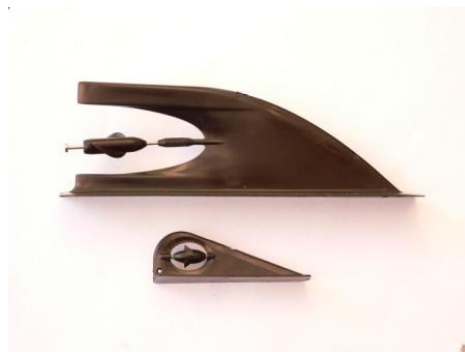
Coxmate Micro Impeller compared to NK impeller